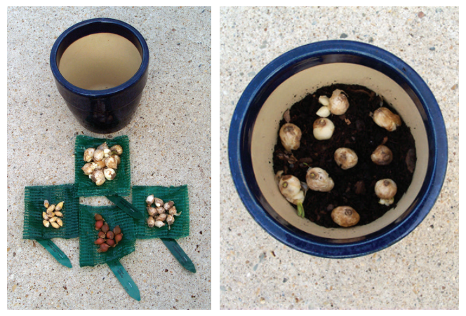
Bulbs laid out for layering (left), and the first layer – the daffodils – ready to be covered (right). Note the blue ceramic pot used to help reinforce the red-white-blue color scheme.