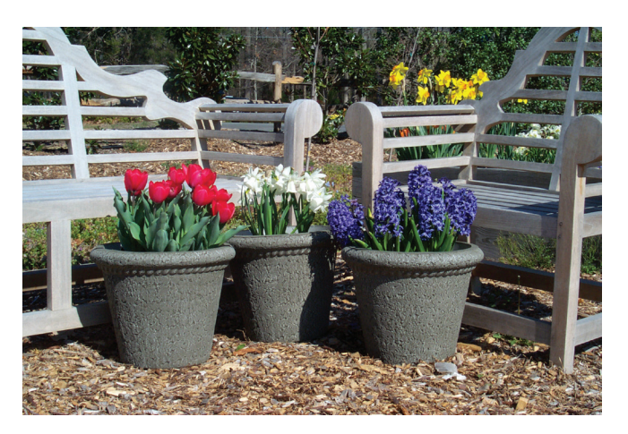
Individual pots of tulip Blue Base, daffodil Horn of Plenty, and hyacinth Blue Jacket (top). One pot with tulip Blue Base, daffodil Jenny, and hyacinth Blue Jacket (right).